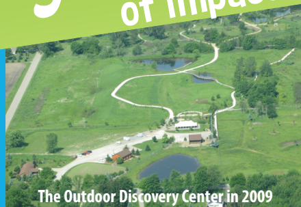
The Outdoor Discovery Center in 2009

During your Park Passport adventure, you'll be able to explore beautiful parks, discover nature, and create memories with friends and family.